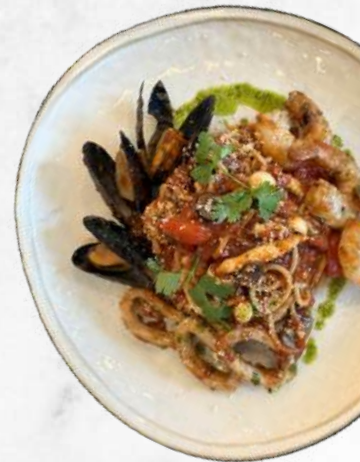
Seafood Marinara Pasta

Spaghetti pasta in tomato marinara sauce, brimming with succulent prawns, calamari and mussels, finished with a sprinkle of fresh parsley and Parmesan cheese.