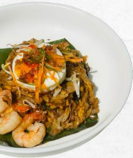
Cantonese Kueh Teow

Cantonese-style flat rice noodles with prawns, squid, shredded chicken, fish cake & pak choy in thick egg gravy.