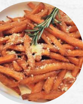
Sweet Potato Fries