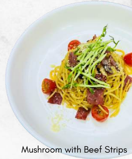
Mushroom with Beef Strips

Spaghetti with sautéed mushroom, streaky beef strips, cherry tomatoes, pea sprouts, parmesan cheese, garlic & chilli flakes.