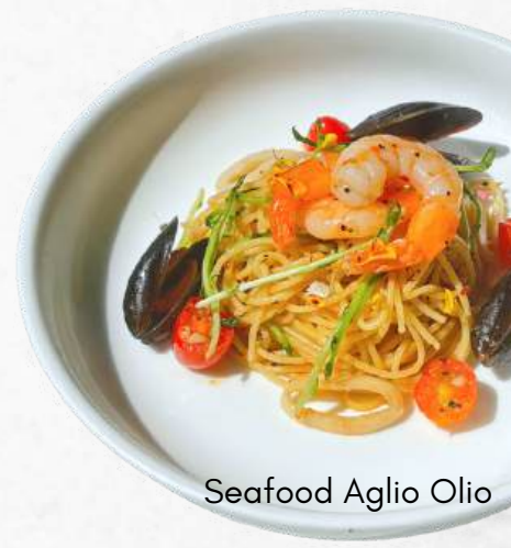
Seafood Aglio Olio

Spaghetti with prawns, squid, mussels, pea sprouts, garlic & chilli flakes.