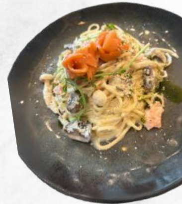
Creamy Smoked Salmon Pasta

Sautéed garlic, mushrooms, and spaghetti pasta tossed in a rich cream sauce, topped with slices of smoked salmon.