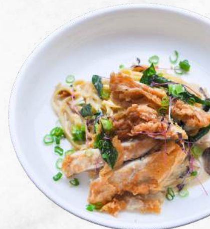
Tempura Chicken Carbonara

Asian inspired carbonara spaghetti with tempura chicken in a creamy sauce with bird's eye chilli, curry leaves.