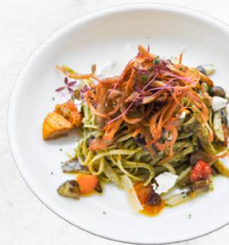
Roasted Pumpkin Pesto

Spaghetti with roasted pumpkin, assorted mushrooms, tomatoes, pesto sauce and grated parmesan cheese.