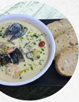
Creamy Garlic Seafood