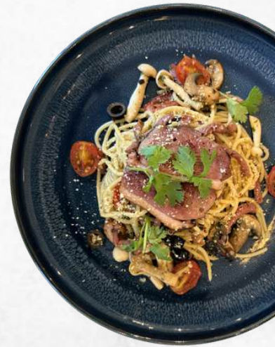
Smoked Duck Aglio Olio

Spaghetti tossed with garlic, chili flakes, oil, cherry tomatoes, and mushrooms, topped with slices of smoked duck breast.