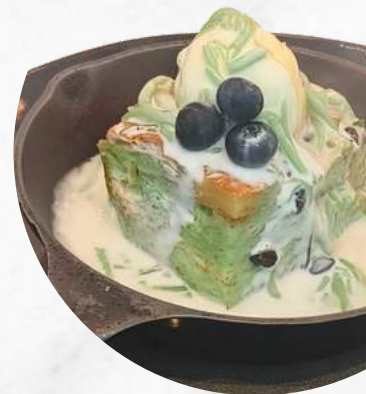
Cendol Bread Pudding

Buttery bread pudding baked to golden perfection, infused with pandan and studded with cendol strands. Served warm with a drizzle of rich coconut milk, gula Melaka, and vanilla ice cream.