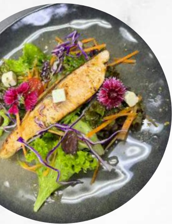
Mediterranean Salmon Salad