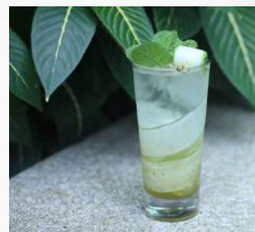
Mint & Lime Quencher